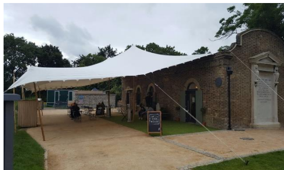
Coal House with Awning, April-October