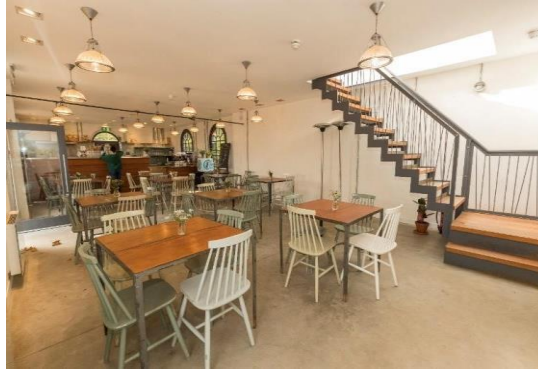
Coal House Interior