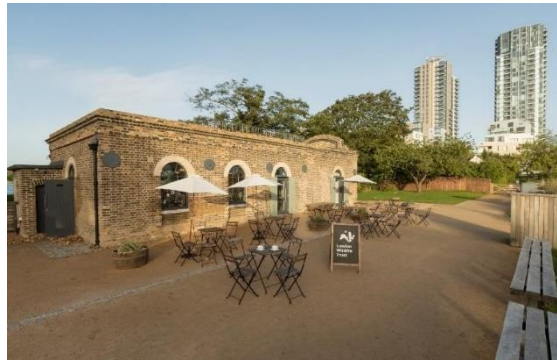
Coal House, Woodberry Wetlands