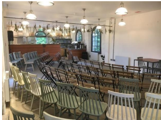
Coal House Interior, Ceremony Layout