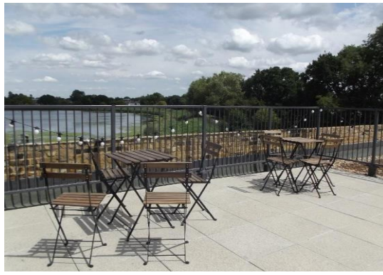
Coal House Roof Terrace, Woodberry Wetlands