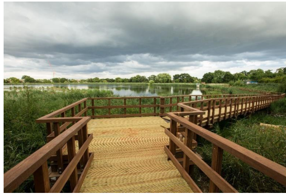
Boardwalk Main Entrance, Woodberry Wetlands