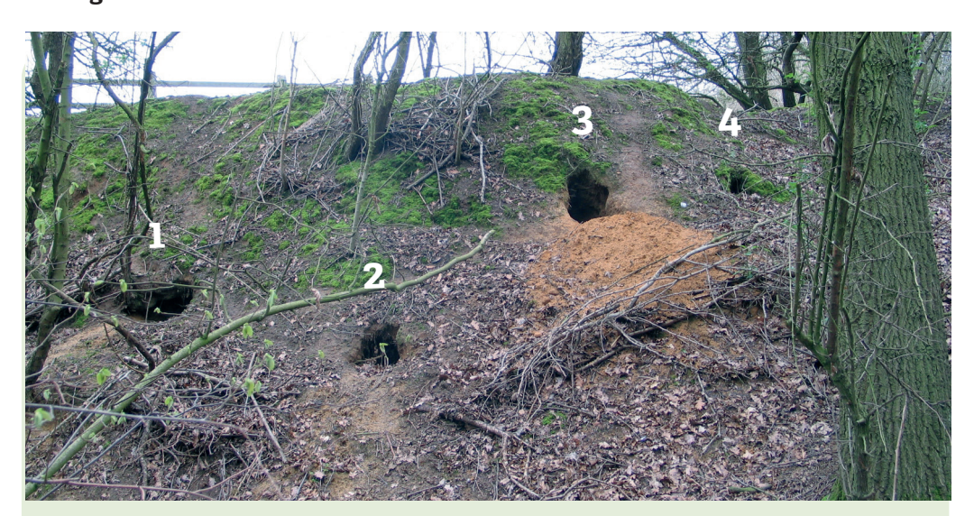
Entrances to part of the same badger sett in a bank. Only entrance 3 seems active: clear of vegetation and the ground has been recently dug out.