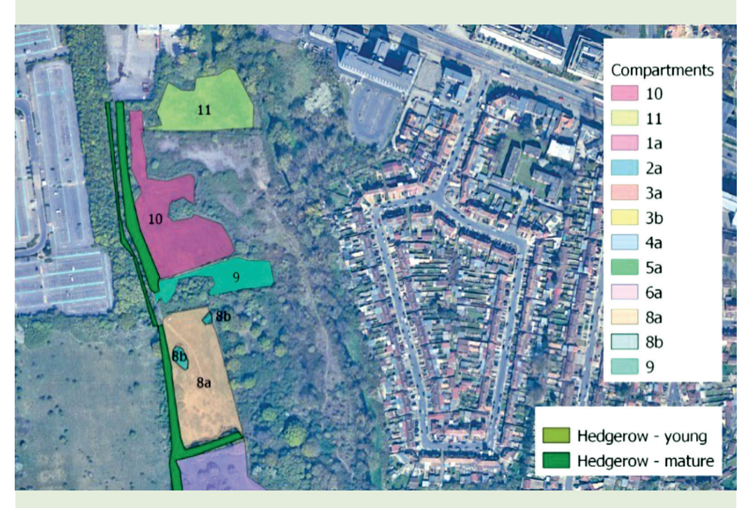
Example of a nature reserve divided into compartments. There will be woodlands with only one compartment. It is not necessary to have more than one.

We recommend drawing the woodland with the approximate compartments (use the form called "Optional, map"), or even better, printing a screenshot from Google Maps or similar to draw on top.