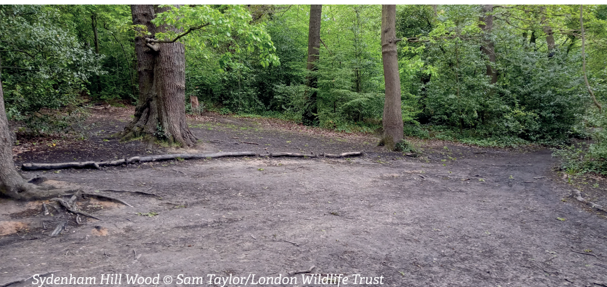
Sydenham Hill Wood

Example of an area heavily eroded and compacted. Originally a path, walkers and their dogs have eroded it beyond the path limits. This is considered eroded and compacted bare ground.