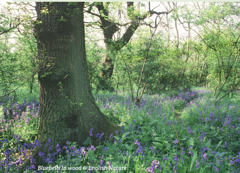
Bluebells in wood

What is the difference between a shrub and a tree? In general, mature trees are taller (above 2m), part of the canopy, and have only one trunk (except hazel; or unless the tree has been coppiced), whereas shrubs can have several trunks. Hawthorn is a species which can be a tree (if it is part of the canopy) or a shrub (lower than the canopy).