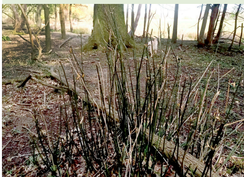
Shrub layer – grazed coppice