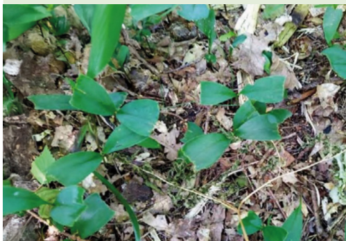
Ground layer – grazed leaves, no flowers