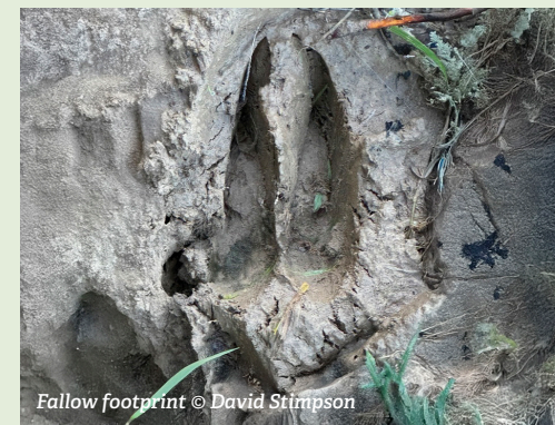
Fallow footprint