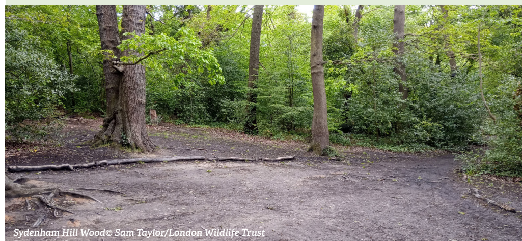
Sydenham Hill Wood

Sections 3.3 and 3.4 should only be filled between mid-March and end of May.