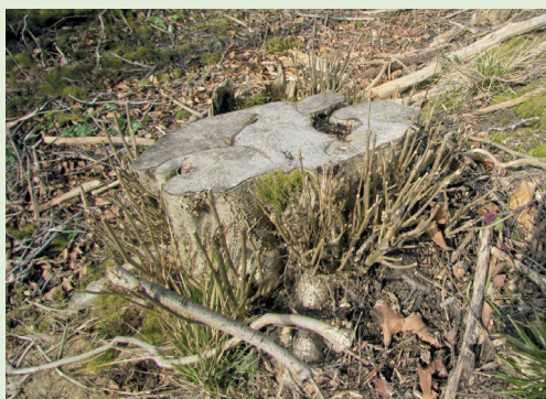
Shrub layer – grazed coppice stool