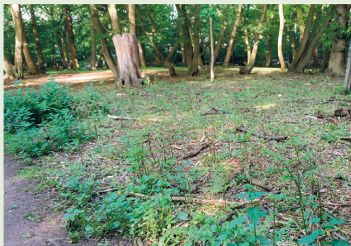
Ground layer – grazed