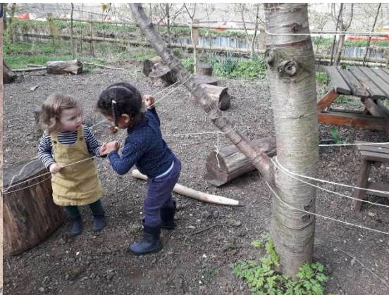
Problem solving with others