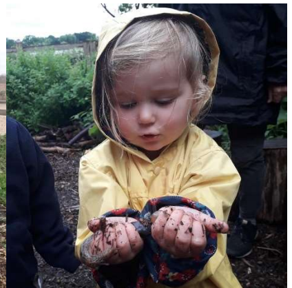
Up close with nature