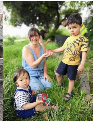
Family bug hunting