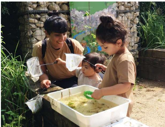
Family pond dipping