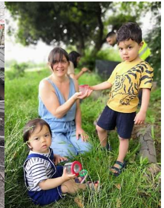
Family bug hunting