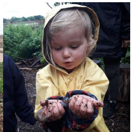
Up close with nature