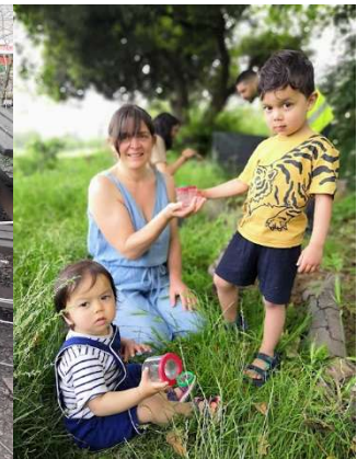
Family bug hunting