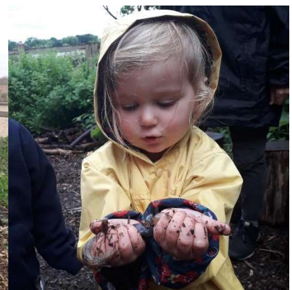
Up close with nature